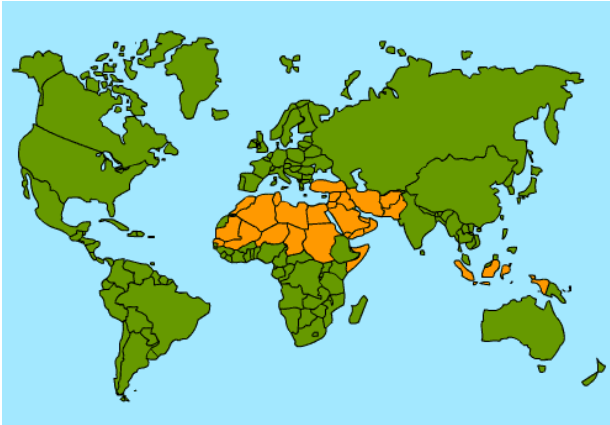
Figure 1: Islam Worldwide

Nowadays, nearly two billion people are Islamic, i.e. about one fourth of the world's population. Islamic countries are shown on the map below.